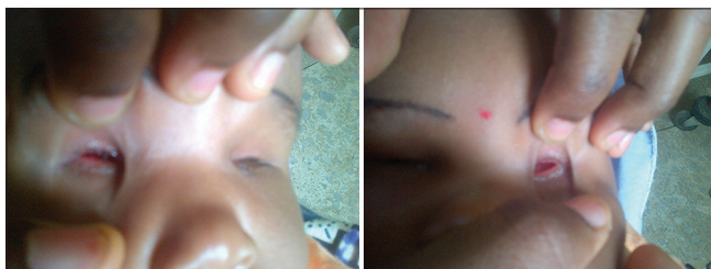
Figure 1: Bilateral anophthalmia

subsequently admitted in the emergency pediatrics unit on account of bronchopneumonia with heart failure. She improved on antibiotics and was discharged home, and her parents were properly counseled. She is being followed up in both the ophthalmology and pediatric cardiology clinics.