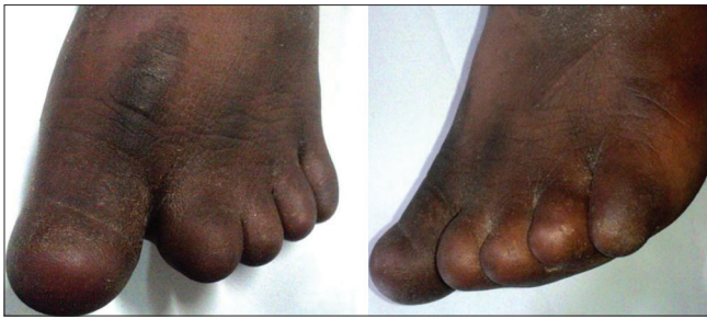
Figure 1: Clinical picture from the front and the sides of the left foot with anonychia, brachydactyly and syndactyly between 2 nd and 3 rd toe