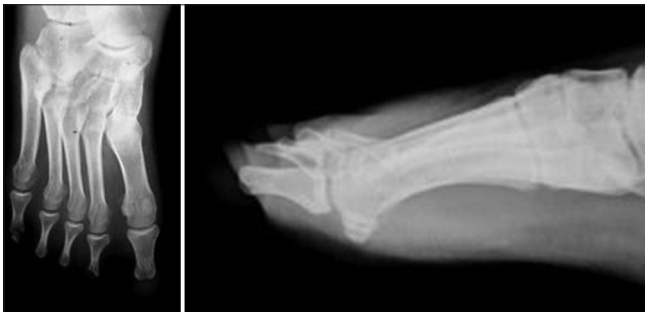
Figure 2: Radiograph anteroposterior and lateral views of left feet showing absence of distal phalanx of all the toes with absence of middle phalanx of toes 1-4, hypoplasia of the middle phalanx of 5 th toe and normal metatarsals