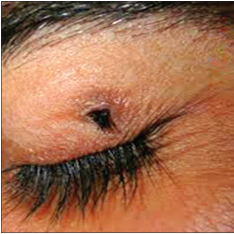
Figure 1: Ectopia cilia with eleven hair lash bundles

sweat glands attached to the follicle. Owen [4] reported a case of ectopia cilia in a 14-year-old boy. Baghestani and Banihashemi [5] reported first case of ectopia cilia with pedigree analysis in a 14-year-old Iranian boy with a positive history of the same anomaly in his paternal grandfather demonstrating evidence of an inherited genetic disorder. Gordon et al. [6] reported that only nine cases of ectopia cilia have been reported so far till 1991.