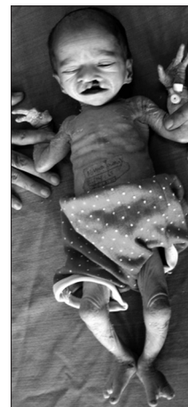
Figure 3: Showing dry scaly skin, sparse hair and eyebrows, cleft palate and limb deformities.

Ectrodactyly refers to variable deformities of hand and feet, having a common central split or cleft, but its occurrence is not obligatory. In a meta-analysis of 230 published cases (116 familial and 114 sporadic), ectrodactyly was found in 84%, ectodermal dysplasia in 77%, clefts in 68%, and anomalies of lacrimal ducts in 59%. Urogenital defects were reported in 52 patients and conductive hearing loss in 33. Isolated cases were more severely affected than familial cases. [7] Our case presented with all the three cardinal features but no eye or genitourinary abnormalities. It is probable that some of the manifestations may take some time to develop, hence are not seen in this neonate. Also, variability in the phenotype within the same family is seen. Annren et al. , suggested that low birth weight and polysyndactyly (without ectrodactyly) may be features of the EEC syndrome. [8] Jindal G. reported a 6 and half-year-old boy