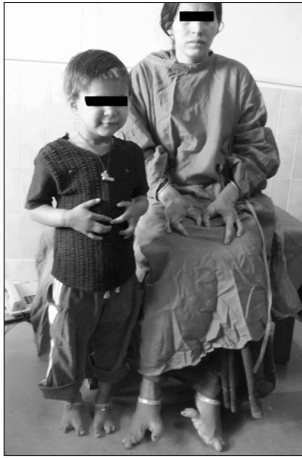
Figure 1: Mother and elder sibling with typical limb deformities.

sibling died at the age of 4 days and according to the mother, he also had similar hand deformities, but no orofacial deformity [Figure 2].