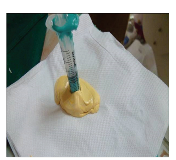
Figure 3: Making putty mold