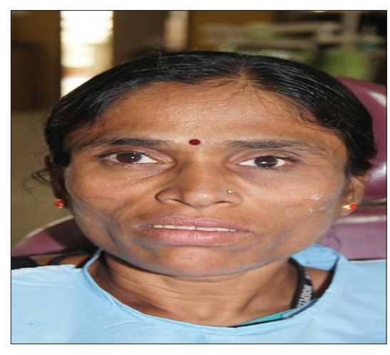
Figure 6: Acrylized eye prosthesis